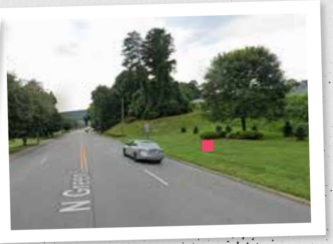
*Near 520 North Green Street.