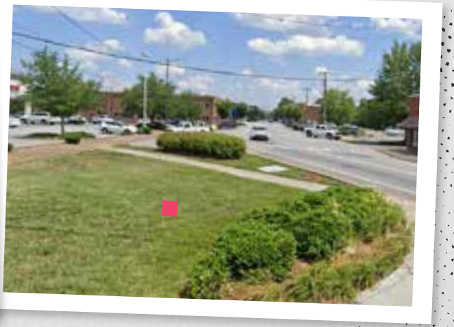
*Near 200 North Green Street.